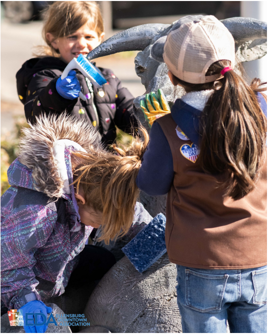
Downtown clean-up in action. Future community leaders doing their part.

Questions? View this 30-minute Q&A session: